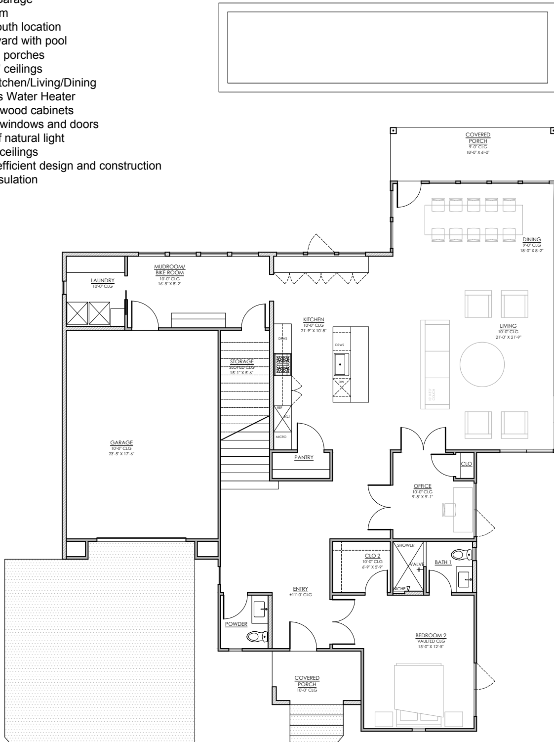
1 FIRST FLOOR PLAN Scale: NTS